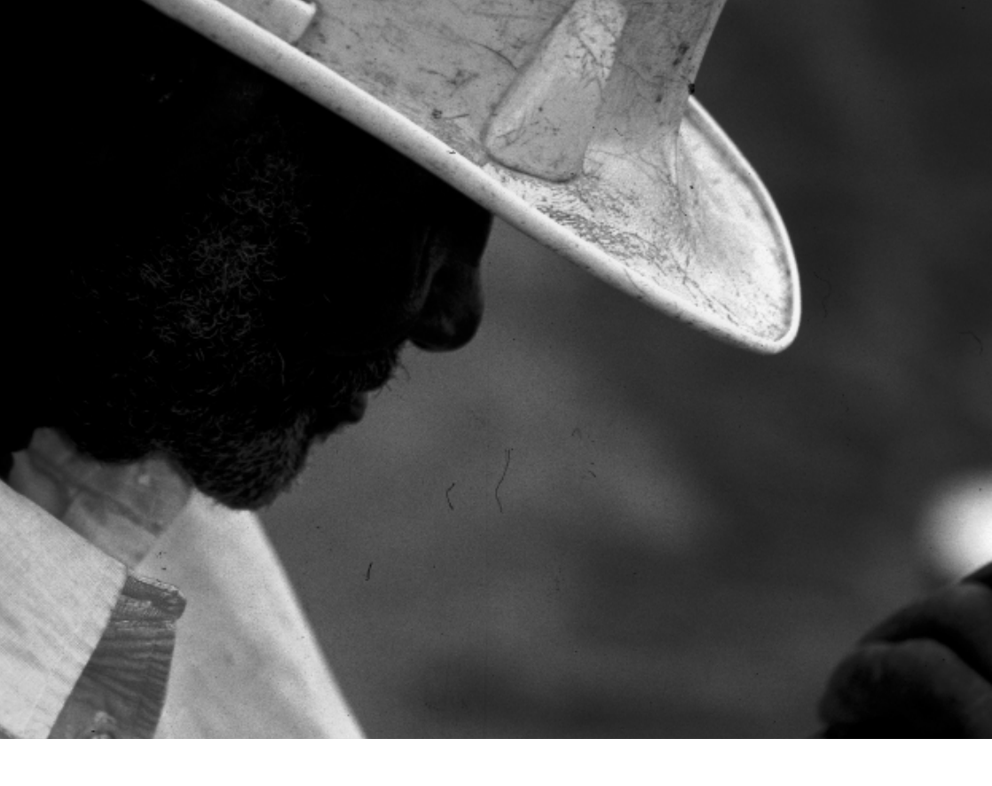
Chapter six Migrant workers and immigrants today