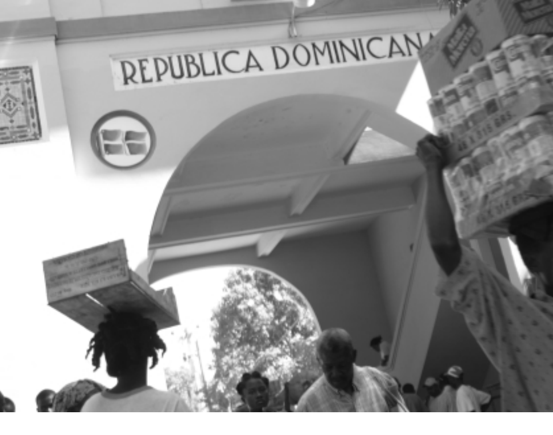
Chapter two Haitian migration