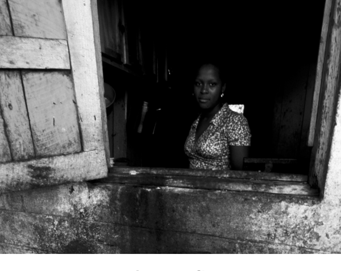
Chapter five Haitian-Dominicans