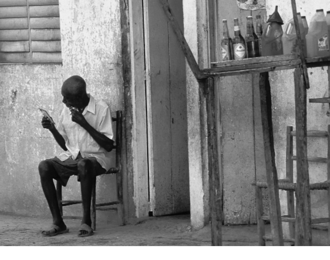
Chapter one The origins of Dominican attitudes to Haitians