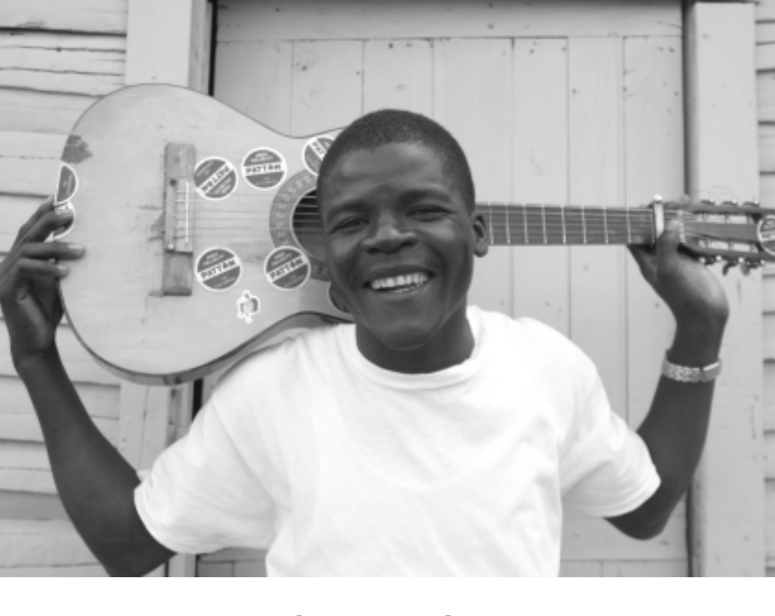
Chapter three 'Haitians' in the Dominican Republic